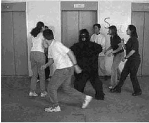
Figure 1. Still from video used by Simons and Chabris (1999).

ing the well-known and highly noxious screech noise. In both Simons and Chabris's and Wayand and Levin's experiments, about half of the observers failed to notice the unexpected stimulus. What makes these failures surprising is that the undetected stimulus was present for several seconds, occupied virtually the same space as attended stimuli, and was bizarre or annoying.