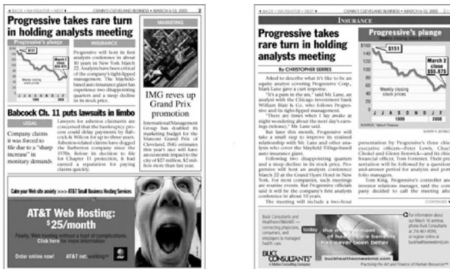
Figure 6. The altered layout and header used in the change-detection experiment.