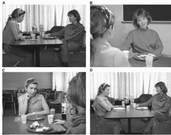
Figure 3. Stills from video used by Levin and Simons (1997). In shot (A), the woman in pink is wearing a scarf, which disappears in the second shot (B), and reappears in shots C and D.

intentionally created sequences where successive views of the same scene contained inconsistent details. For example, one shot showing a woman wearing a scarf cut to another shot of the same woman without the scarf (see Figure 3). The film cut proved to be an effective mask, as every participant who viewed the tape failed to notice the scarf's disappearance. In a second experiment, Levin and Simons showed participants a video in which the sole actor in a two-shot video changed clothes and identities across a film cut. Even though most observers were presumably attending to the changing actor, about 50% failed to notice the substitution when it was unexpected. Simons and Levin (1998) even demonstrated that CB can occur in a real-world social interaction; about 50% of naive participants failed to notice the replacement of one conversation partner with a completely different person when the switch took place behind a passing door (see Figure 4).