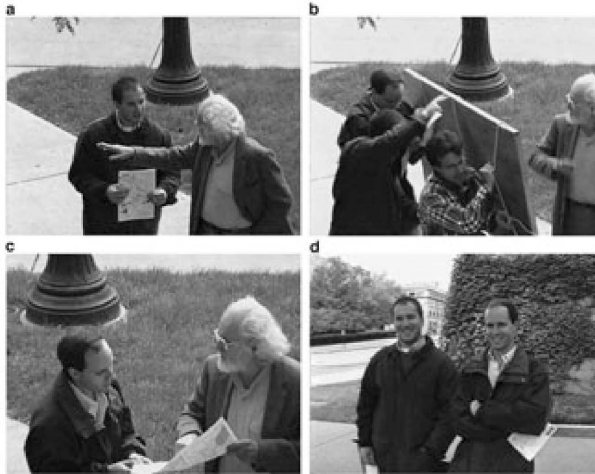
Figure 4. An unsuspecting participant in the real-world person-switch experiment (Simons & Levin, 1998). In box A, the initial experimenter approaches a pedestrian. In box B, the initial experimenter walks away behind a passing door, and another experimenter finishes the interaction (box C). Box D shows the switching experimenters side by side. Reprinted from “Failure to Detect Changes to People in Real-World Interactions,” by Simons and Levin (1998), Psychonomic Bulletin and Review , 5, 644–649. Copyright 1998 by the Psychonomic Society. Reprinted with permission.

between change detection and attention. For example, experiments using the flicker paradigm find that changes to items that capture attention (e.g., a horizontally oriented item in an array of vertical items) are detected more quickly than changes to items that don't (Scholl, 2000) and changes are usually not detected until the eyes, and therefore attention, fixate a changing region (Hollingworth, Schrock, & Henderson, 2001).